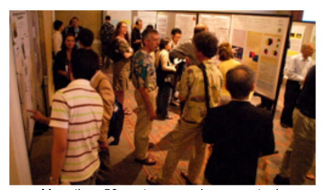
More than 50 posters covering every topic were available for viewing and discussion