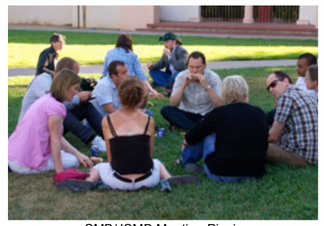
SMB/JSMB Meeting Picnic