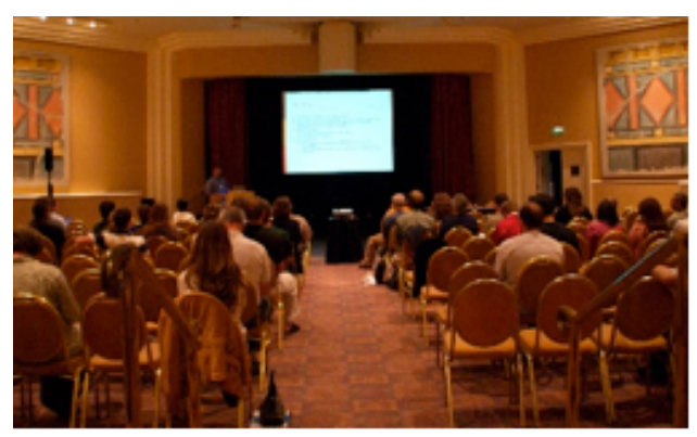
Many excellent plenary, mini-symposium and contributed talks were given