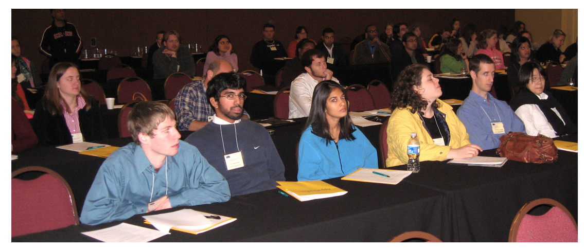
Participants included students and faculty of 16 different institutions