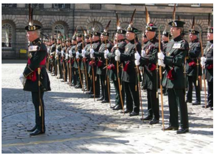
The Royal Company of Archers (Sovereign's Bodyguard in Scotland)