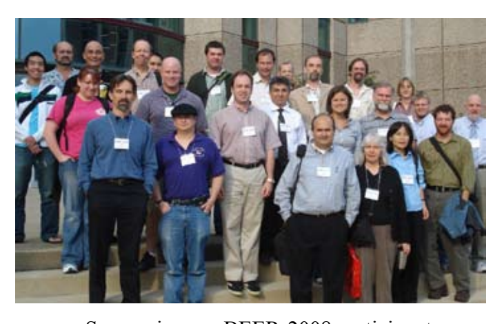
Symposium on BEER-2008 participants