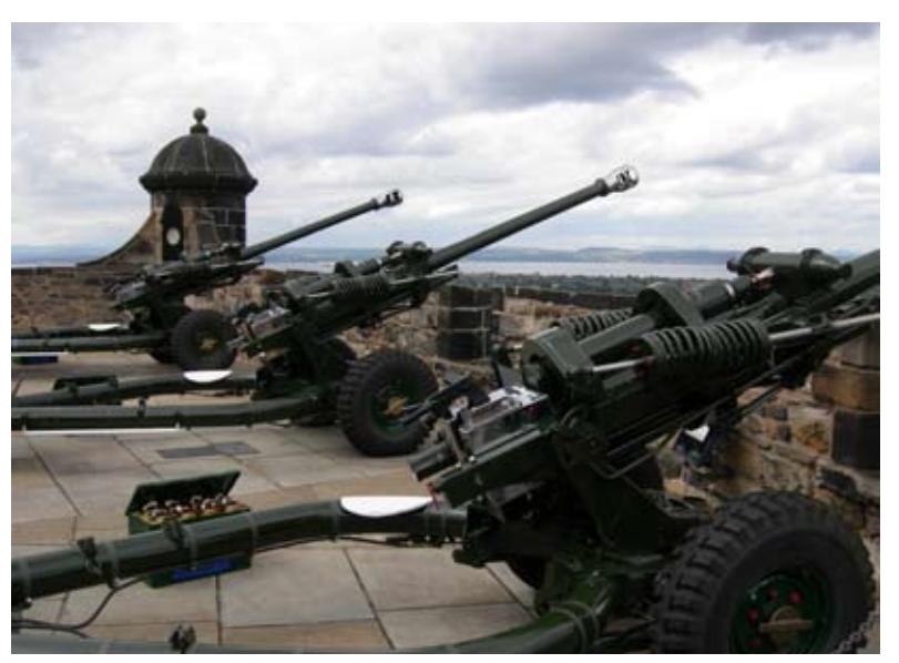
Cannons at the Edinburgh Castle

I would like to acknowledge the Society for Mathematical Biology, the European Society for Mathematical and Theoretical Biology, the New Zealand Mathematical Society, the University of Otago Renal Research Theme and the University of Canterbury Department of Mathematics and Statistics for their generous funding that enabled me to attend this conference.